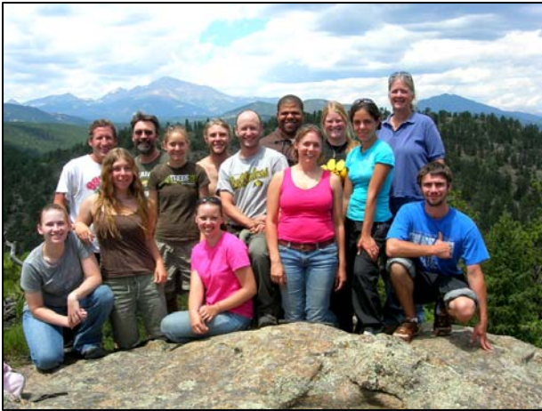
Class of 2007 at Cal-Wood

Earn 3 undergraduate credits in the foothills of the Rocky Mountains at the spectacular 1,200-acre, private Cal-Wood Education Center