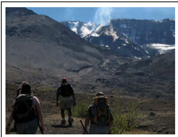
The growing lava dome at Mount St. Helens